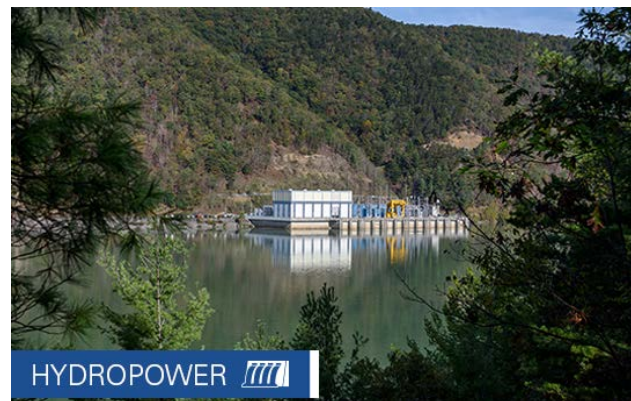
Bath County Pumped Storage Station, the world's most powerful pumped hydro facility.