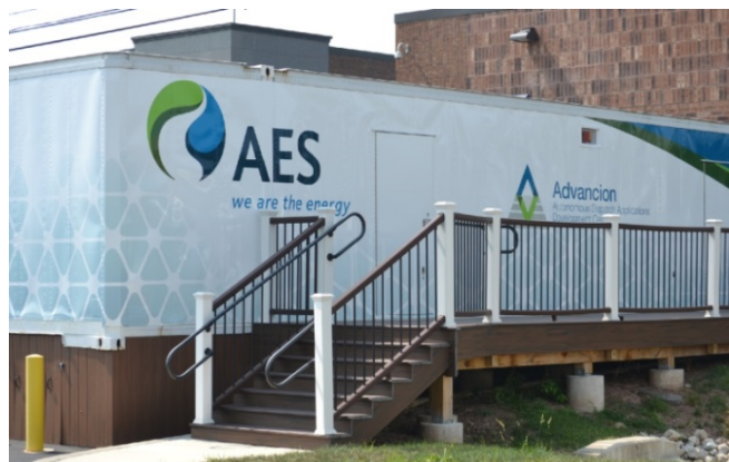
A two megawatt lithium-ion battery located at PJM's headquarters providing frequency regulation.

In this way, we have helped bring about the vision of open access and competition that emanated from this Committee back in 1992 with the passage of the 1992 Energy Policy Act. And along the way, we have embraced an "all of the above" strategy that has enabled the PJM markets to serve as a home for innovative new technologies, ranging from energy storage to demand response, as well as more conventional resources such as coal, nuclear and natural gas. The policy embraced by